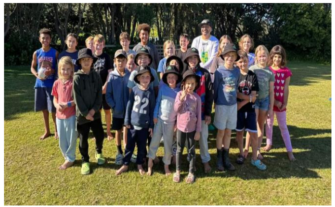
Ki o Rahi

If you have some spare strawberry runners, we would like some to put into the garden.